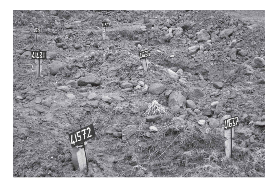
Cemetery of the Companionless, Turkey